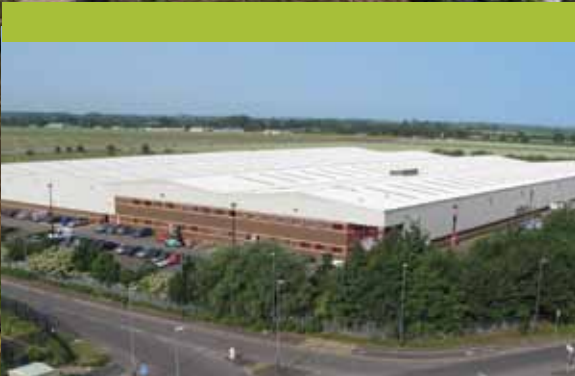
Munster Joinery United Kingdom