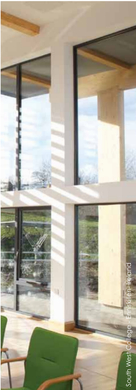
South West College - Enniskillen - Ireland

Munster Joinery Passive window ranges have been used in a wide variety of Passive certified projects in Ireland, Northern Ireland and UK. Many of these exemplary buildings have won awards for excellence. Buildings from domestic, commercial, social housing, educational sectors are represented in this portfolio of projects. On these projects we have worked with multidisciplinary teams to achieve a successful outcome.