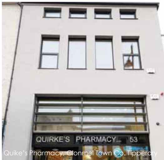
Quirke's Pharmacy, Clonmel Town Co. Tipperary