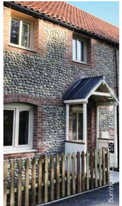
Burnham Overy Stidfine Norfolk - UK