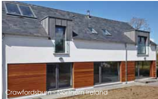
Crawfordsburn - Northern Ireland