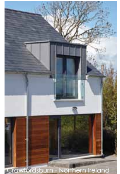
Crawfordsburn - Northern Ireland